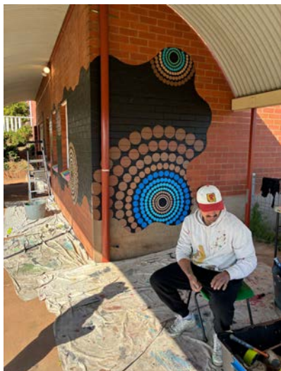
Aboriginal Mural - taking form!!